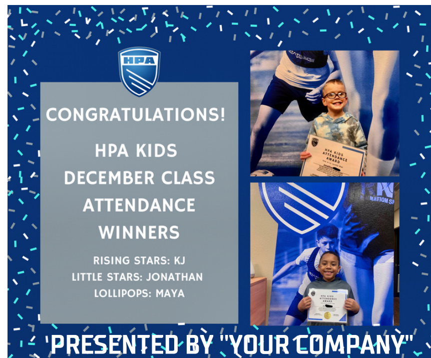
SOCIAL MEDIA POST EXAMPLE OF AN AWARD

Become presenting sponsor of our future stars & leaders, or what we refer to them HPA Kids! With a total of 6 seasons of 8-week enrollments per year, we see over 3,000 students of ages 2-6 come through our programming!